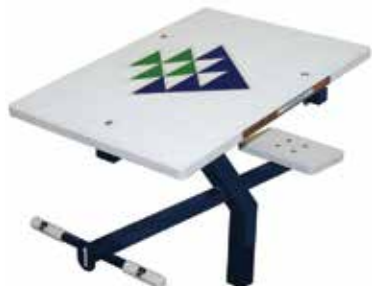
Track Start Quickset Side Mount Platform (shown with options)